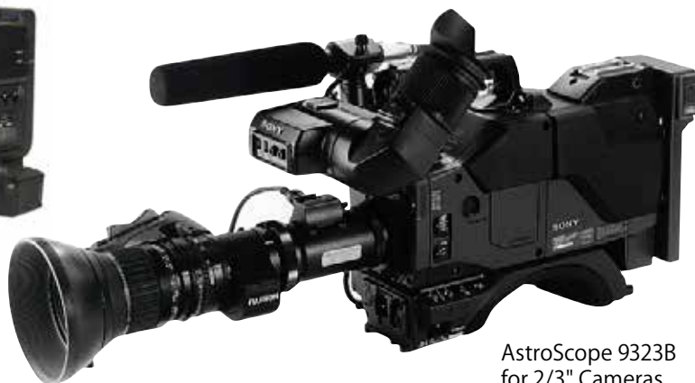
AstroScope 9323B for 2/3" Cameras