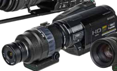
AstroScope shown on Sony Handycam Video Camcorder