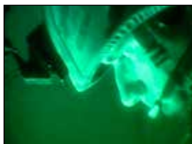
Electronic News Gathering