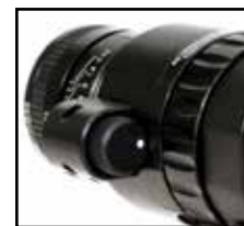
variable gain feature

We have models that feature automatic gain control plus includes a manually adjustable maximum output brightness permitting the user to achieve the optimum balance of brightness and clarity in the image.