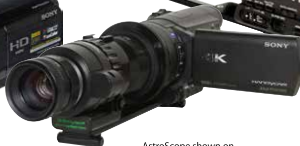
AstroScope shown on Sony AX-1 Handycam Video Camcorder