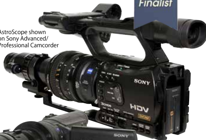
AstroScope shown on Sony Advanced/ Professional Camcorder