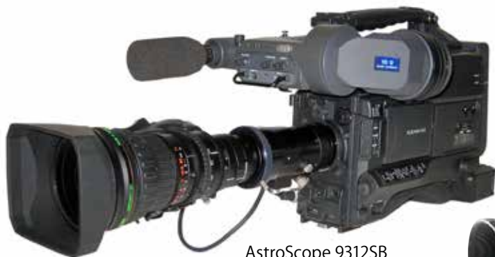
AstroScope 9312SB for 1/2" Sony Cameras