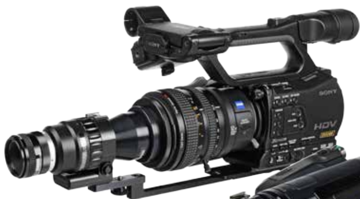
AstroScope shown on Sony NX-5U Video Camcorder